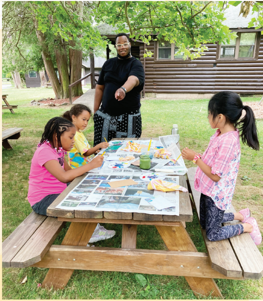
Nyack Day Camp

This summer we again benefited from the participation of three day camps: Nyack Center Day Camp, Strawtown Day Camp, and New Settlement Day Camp.