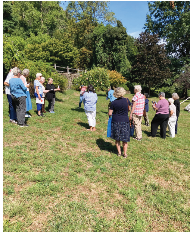
Prayer Ritual of hanging our flames on the tree