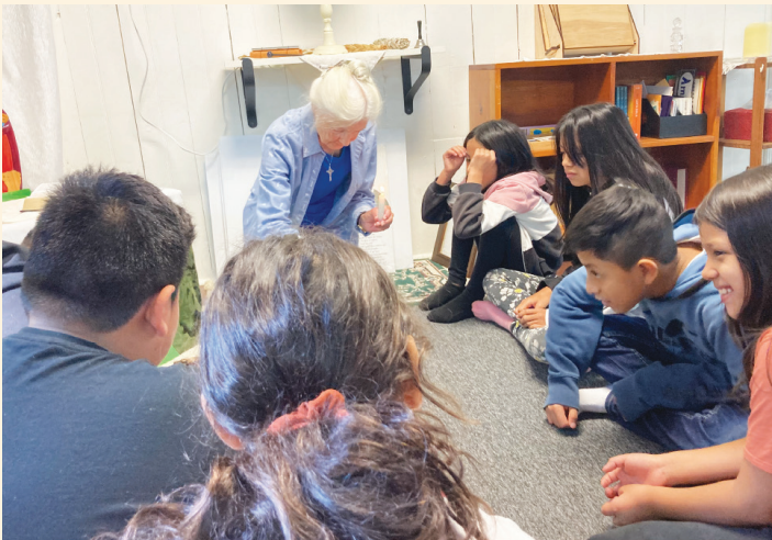
Sessions begin and end with prayer