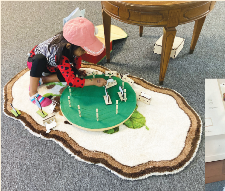
A student sets up the parable of the Good Shepherd

This year we are trying to have two sessions of the Good Shepherd Catechesis. The first for the little ones, 5-7 year olds, and the second hour for the older ones, 8-13 year olds. So far we have 5 children in the first session and 8 in the second. It was a pleasure to see how eager the little ones were to return to the classes!