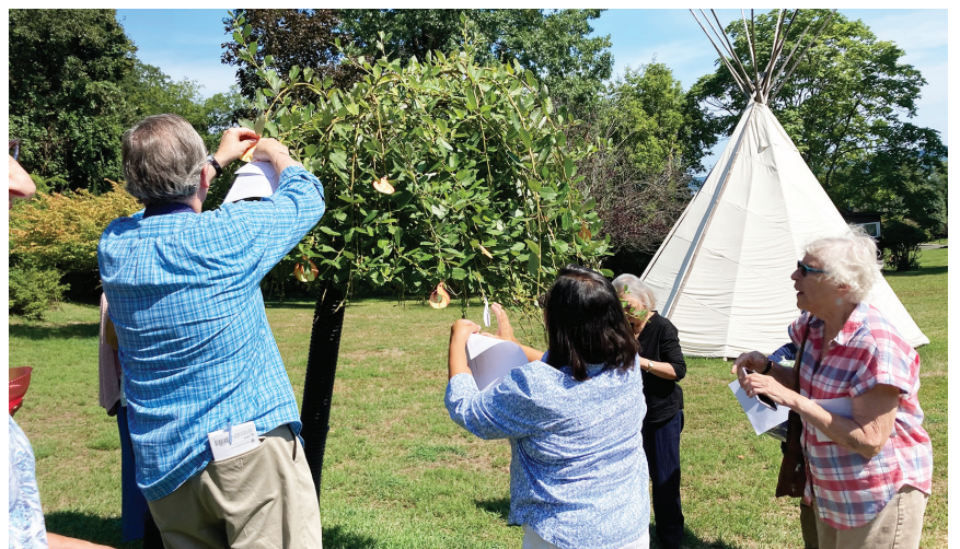
Flames on the tree