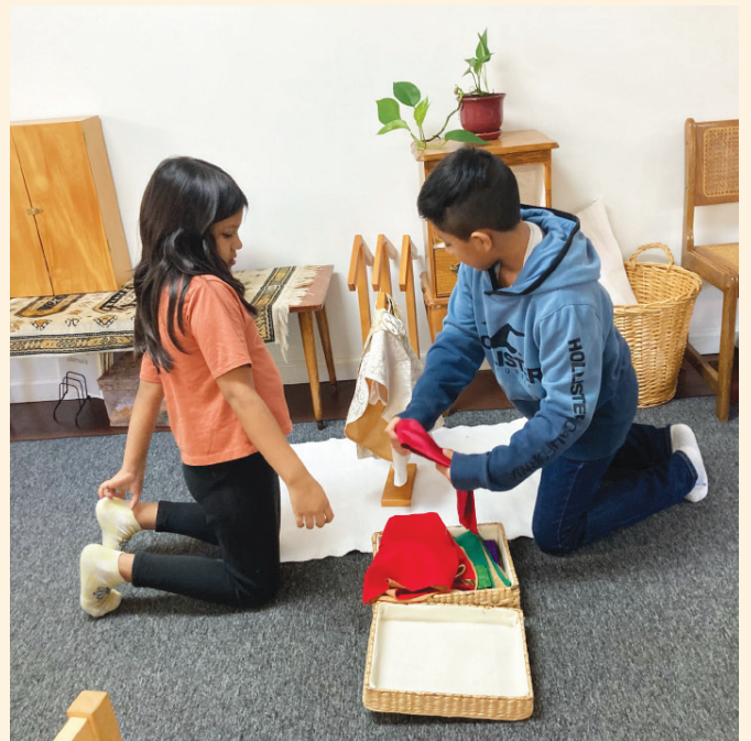
An older student helps a younger one with the vestments for mass.