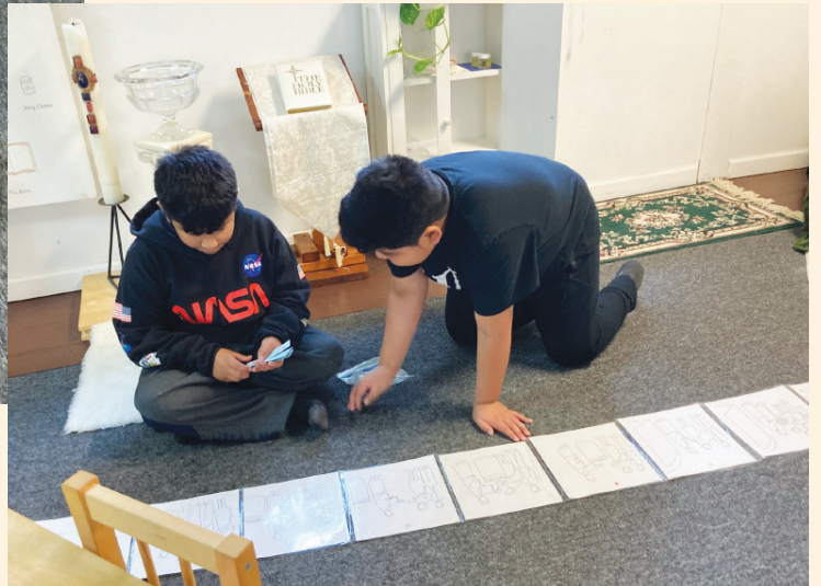
Two students line up the seven sacraments